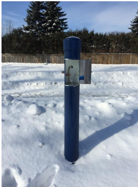
Photo: Sample Station on Main St. N.