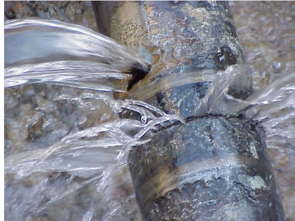
Photo: Broken Water Main

In order to deliver safe drinking water to the residents of Newmarket, the Town of Newmarket had to incur various significant expenditures. The expenses that were made were for infrastructure repairs, replacement and reconstruction projects, and contracted services.