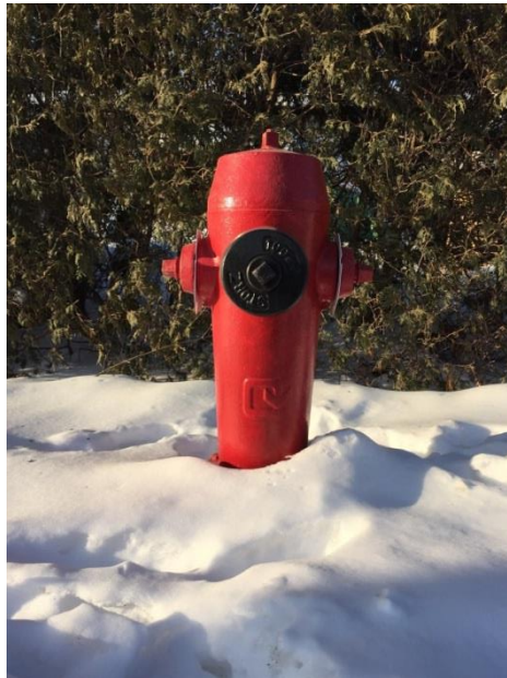
Photo: Fire Hydrant in Newmarket, Ont.

From January 1, 2014 to December 31, 2014, over 1000 regulatory microbiological and chemical quality samples were taken, by certified operators, from sample locations which have been well distributed throughout Newmarket. These samples were delivered to the York-Durham Regional Environmental Lab, which is an accredited, licenced laboratory, for analysis. In all cases, the drinking water supplied to all customers was confirmed safe.