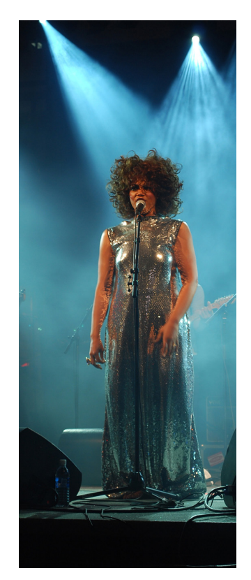
Measha Brueggergosman -Lee performing September 2009.