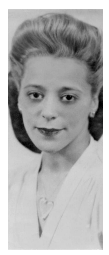
Viola Irene Desmond. c.1940.