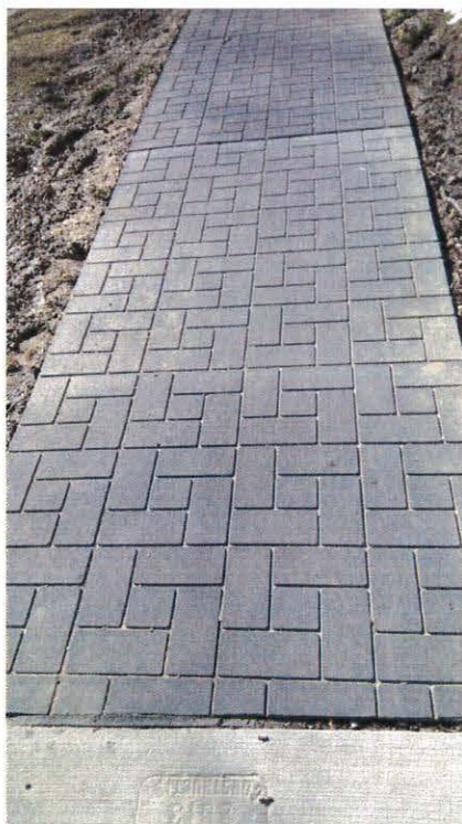
178 Victoria Street

Below are photos that illustrate the condition of the sidewalks.