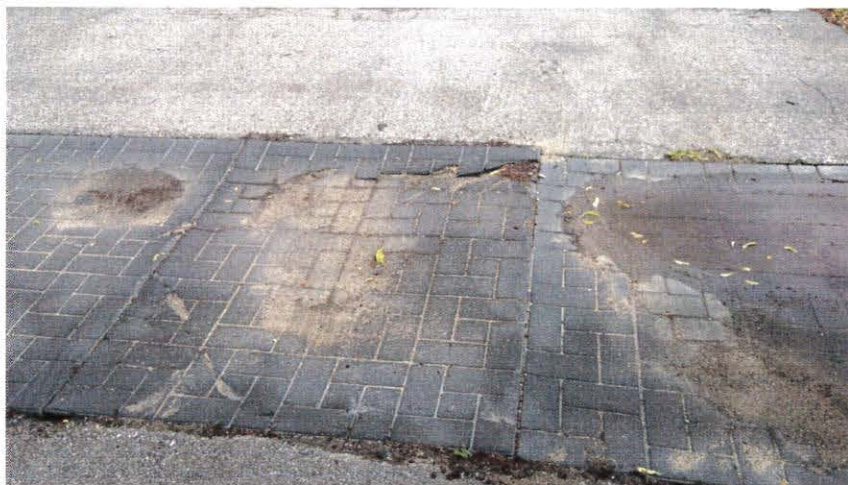
70 London Road