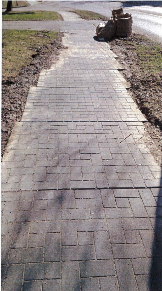
261 Queen Street