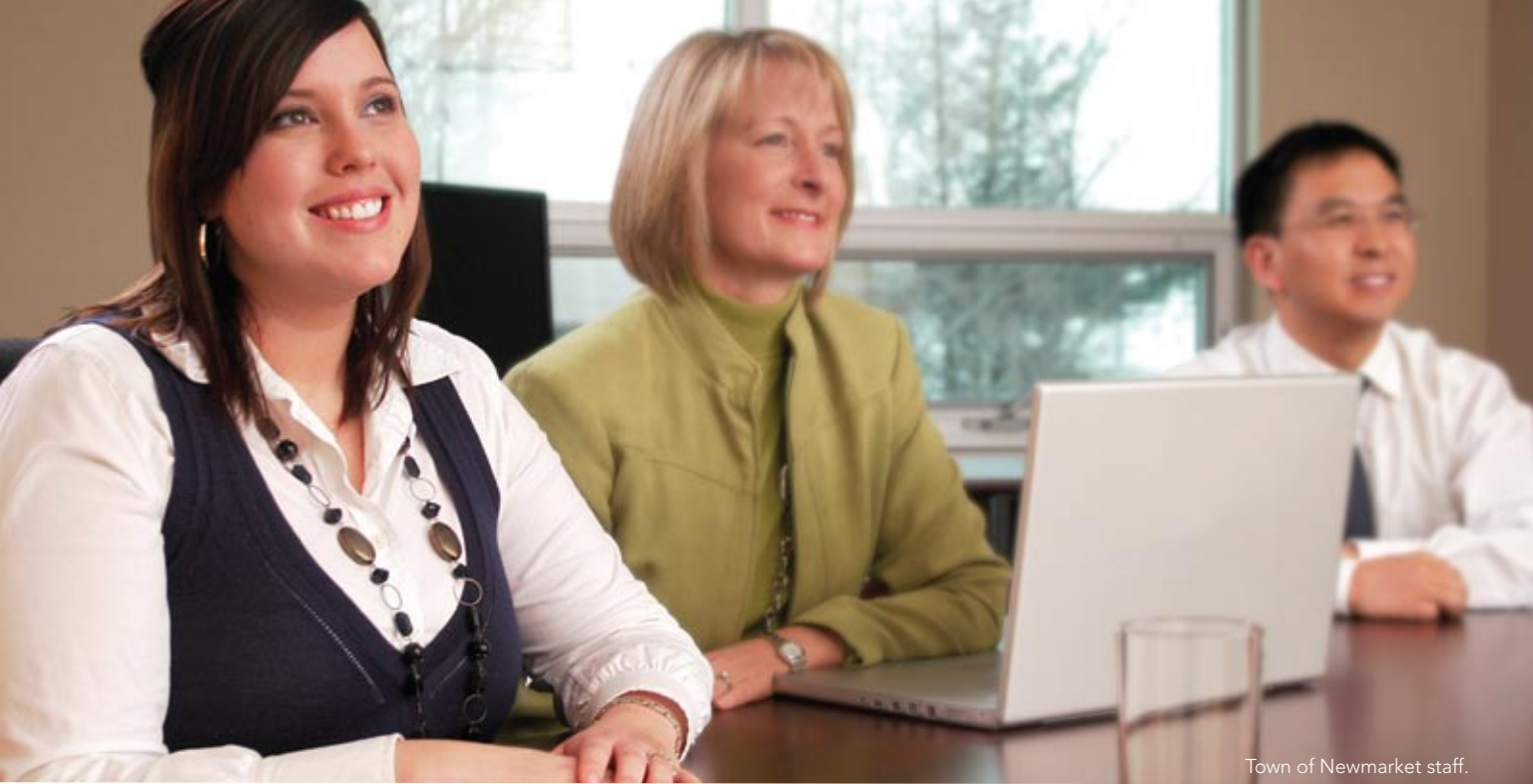
Town of Newmarket staff.