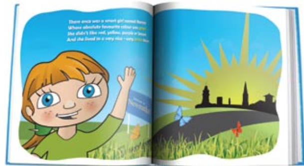
Newmarket's first storybook - Noreen & the story of a green town – was distributed to all Grade 1 students in town.

The BizPaL service in Newmarket was developed by the Town of Newmarket, the Province of Ontario and the Government of Canada. Area business owners and entrepreneurs can access the service by visiting www.ServiceOntario.ca/bizpal or www.newmarket.ca and clicking on "Business Centre."