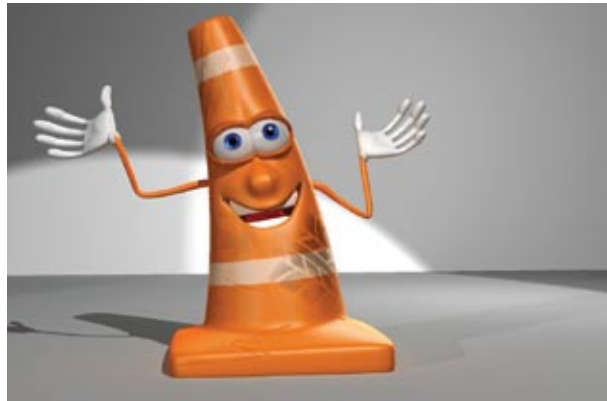
Safety Cone Sam spread the word about the importance of traffic safety through a public education campaign in the fall of 2008.

In October 2008, the Town of Newmarket launched Safety Driven , a public education campaign promoting the Town's traffic management programs. The objective of the Safety Driven campaign is to reinforce positive driving habits and discourage negative habits like speeding and aggressive driving. The campaign focuses on the three elements of traffic management – education, enforcement and engineering. Safety Cone Sam – the official mascot of the Safety Driven campaign – spread the word about traffic safety and encouraged residents to make a positive change in their neighbourhood in 2008.