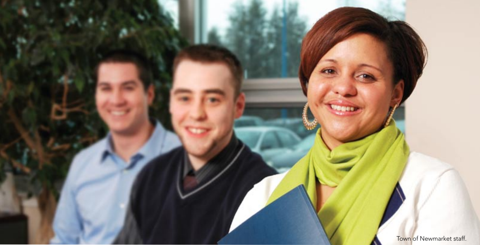
Town of Newmarket staff.