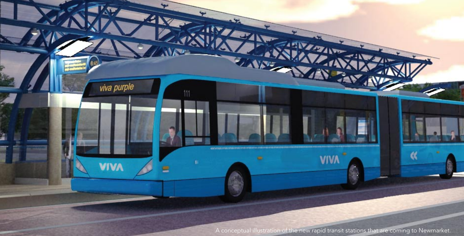
A conceptual illustration of the new rapid transit stations that are coming to Newmarket.