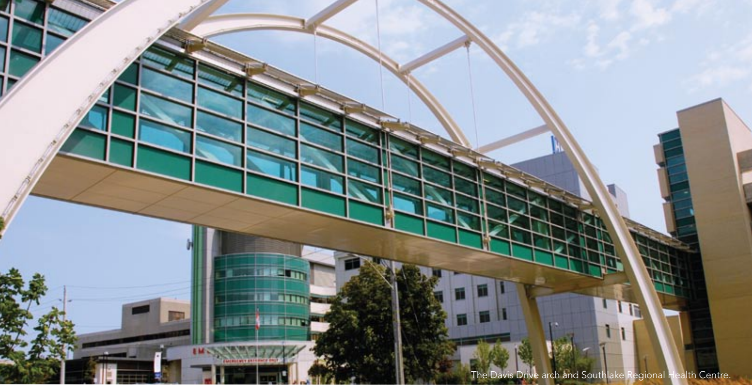
The Davis Drive arch and Southlake Regional Health Centre.