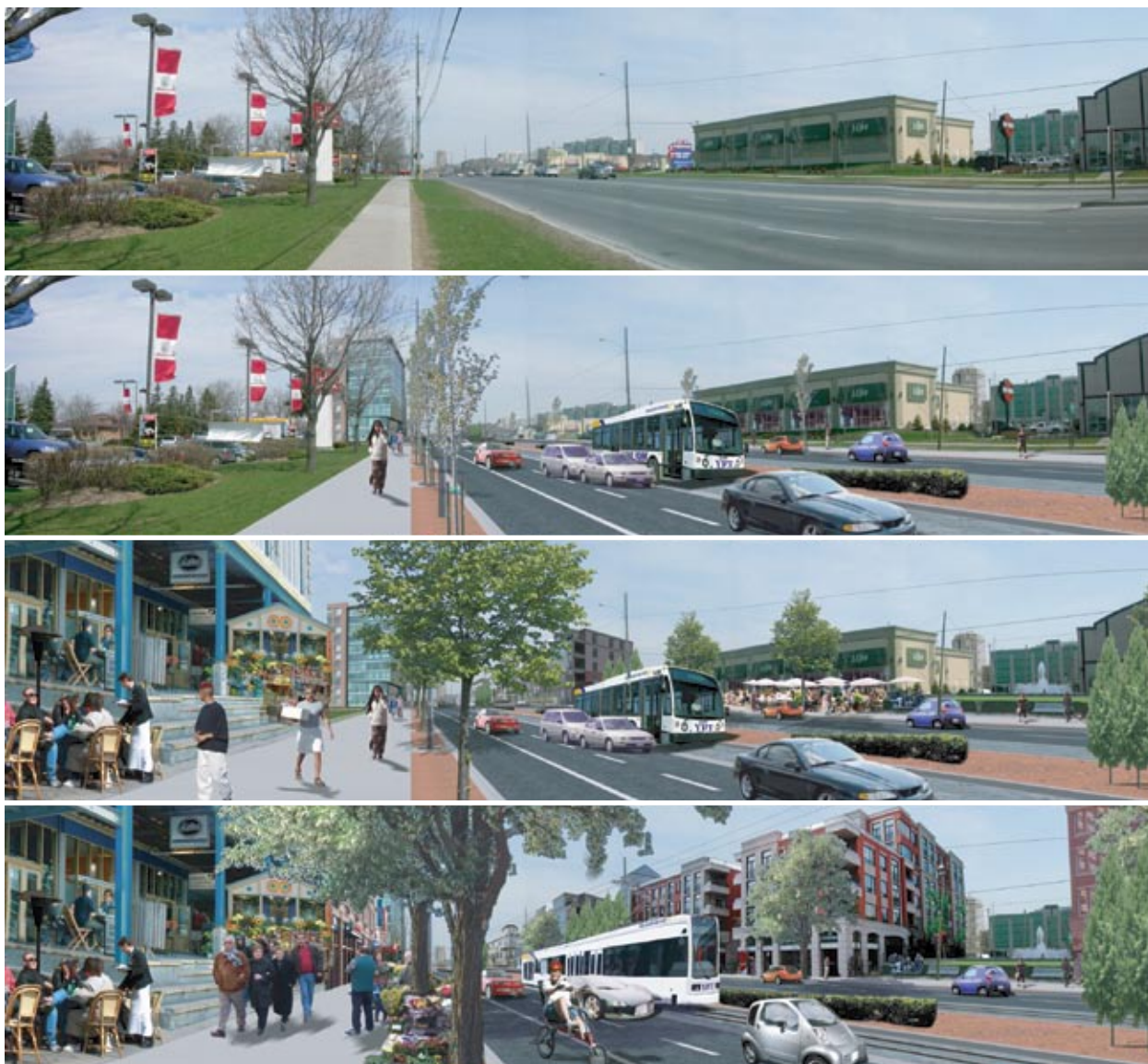
An artistic approximation of how Newmarket's Yonge Street and Davis Drive may evolve as a result of the new Official Plan supported by a new rapid transit system.

THESE GATEWAYS WILL ENCOURAGE MIXED-USE, TRANSIT-ORIENTED DEVELOPMENT AND PROVIDE VIBRANT, PEDESTRIAN-FRIENDLY PLACES FOR PEOPLE TO LIVE, WORK, PLAY AND SHOP.